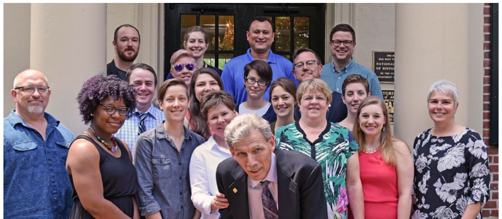
2016 Substance Use & Addictions Specialist program graduates and instructors.

The School of Social Work has developed four courses and two workshops that meet the NCSAPPB requirement of 180 hours of substance abuse specific education for the LCAS credential. Further LCAS information can be found at ncsappb.org .